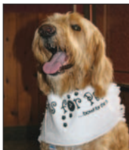
Jerry the Dog

Jerry the Dog from the Ronald McDonald House of the Twin Cities will also be on-hand as the official Pins For Pets greeter.